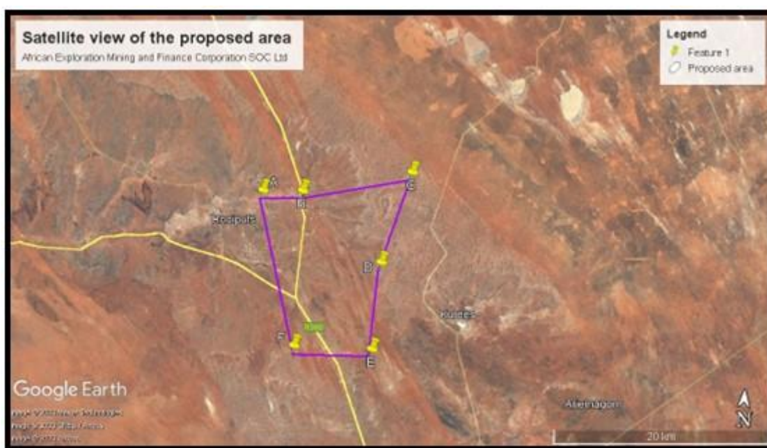
Figure 1: Satellite view of the proposed prospecting right area of African Exploration Mining and Finance Corporation SOC Ltd (image obtained from Google Earth).

The area indicated as Ecological Support Area matches that of the Aquatic Biodiversity Theme. This correlation is considered to be realistic since the areas which may contain water would be the most important in that arid landscape. The pans were the only place where animals such as Springbok were seen and it was also noticed that they contain numerous Ground Squirrel as well as a smaller number of Bat-eared Fox burrows. Should the mitigation measures and monitoring programmes proposed in this document be implemented, no fatal flaws could be identified that prevents the prospecting activity continuing.